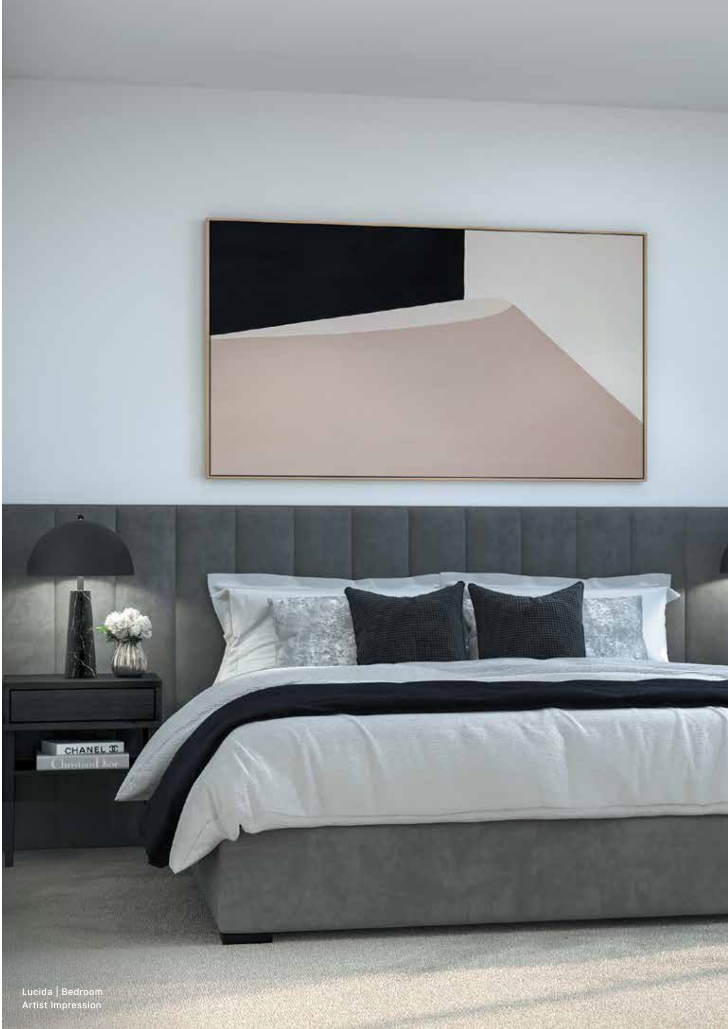
Lucida | Bedroom Artist Impression