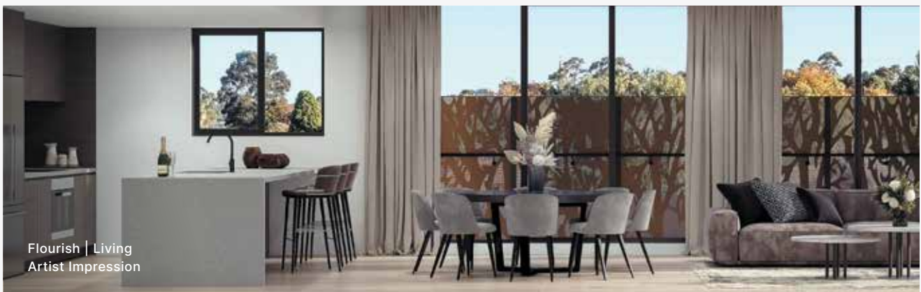
Flourish | Living Artist Impression