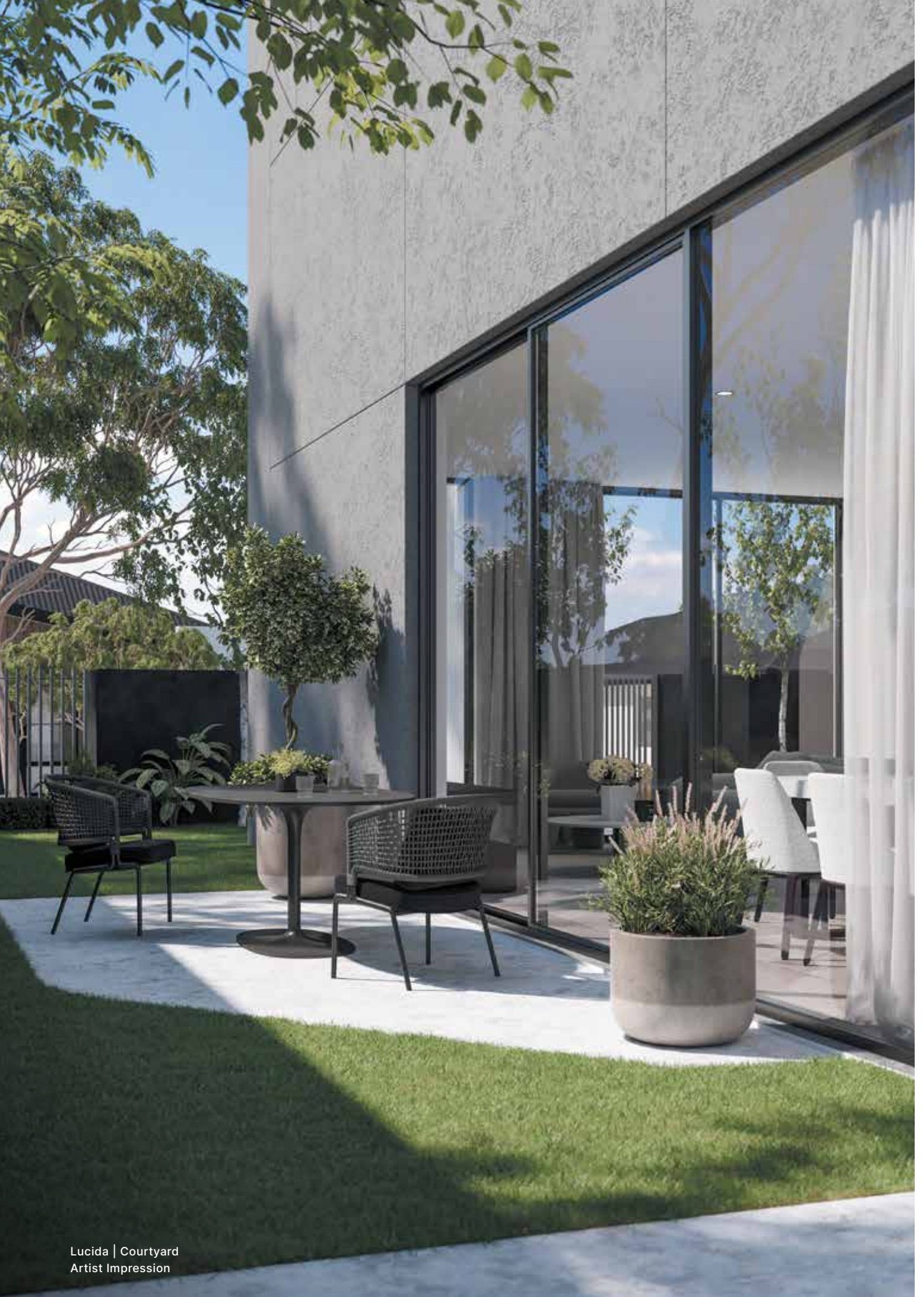
Lucida | Courtyard Artist Impression