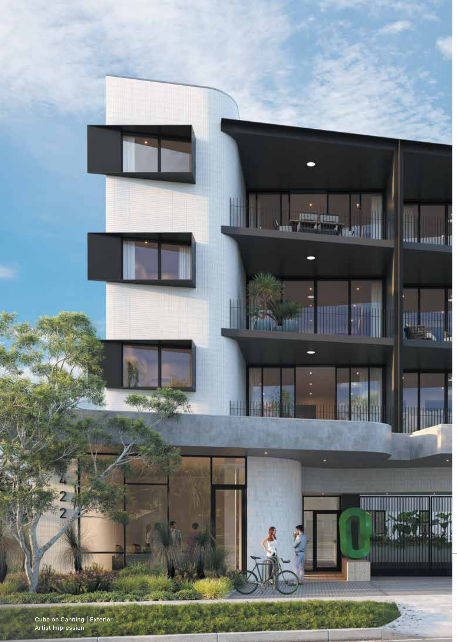
Cube on Canning | Exterior Artist Impression